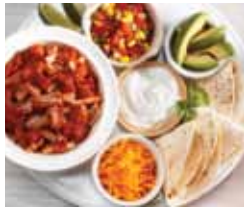
Slow Cooker Southwest Shredded Pork